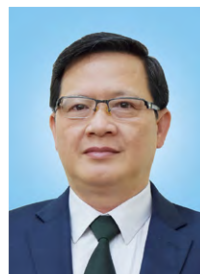
Deputy Minister MAI LUONG KHOI (from 2020)