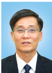
Deputy Minister NGUYEN KHANH NGOC (from 2014)