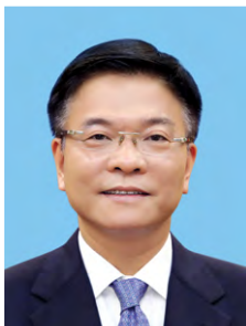
Minister LE THANH LONG (from 2016)