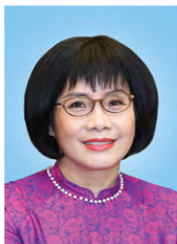
Deputy Minister DANG HOANG OANH (from 2018)