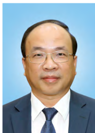
Deputy Minister PHAN CHI HIEU (from 2014)