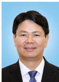
Deputy Minister NGUYEN THANH TINH (from 2020)